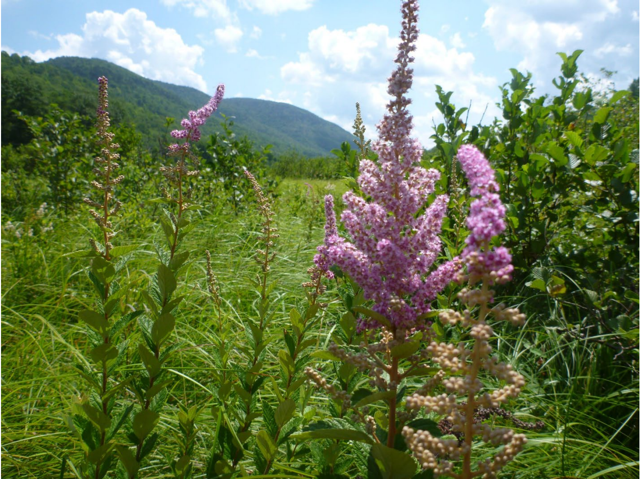
Steeplebush flowers in a marsh.