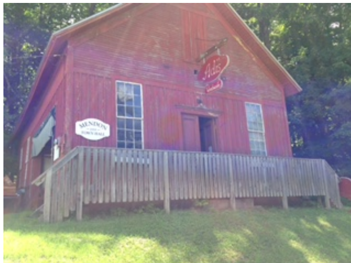
Original Mendon Town Hall Constructed in 1888