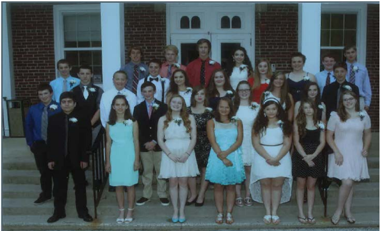
Bartow Graduating Class of 2015