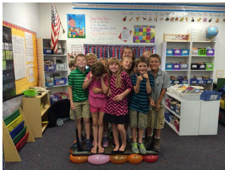
Barstow 3 rd Grade Science Class