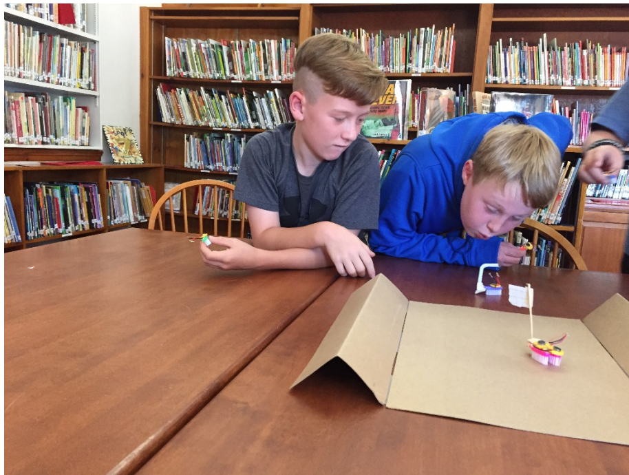
Barstow 5 th grade students Maker Space

A maker space is a hands-on area with tools and resources that inspire students to become participatory learners to uncover their talents and interests by making, producing, solving, creating, collaborating and thinking.